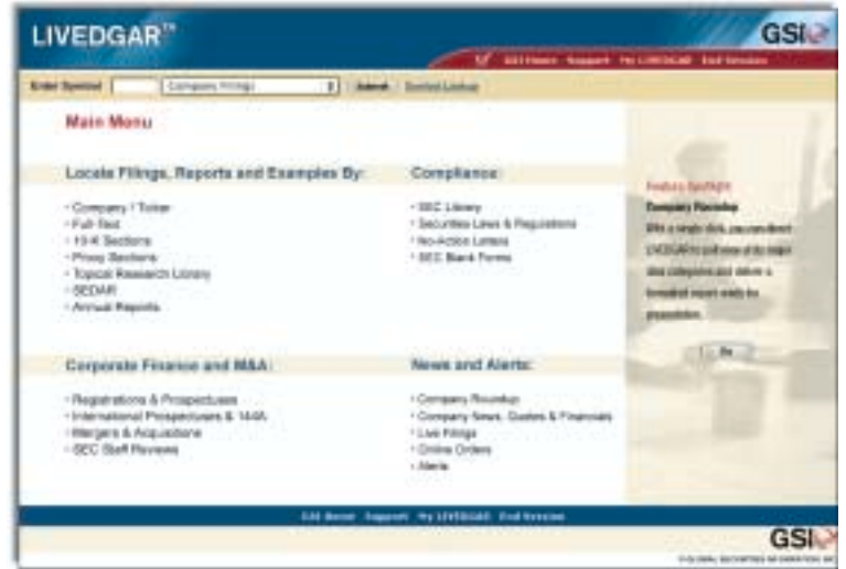
Check out the new look today by logging in to LIVEDGAR at www.gsonline.com .

With this enhancement to the Main Menu, LIVEDGAR also introduces a new Feature Spotlight element where LIVEDGAR features are highlighted on a rotating basis, ensuring that you are kept up-to-date on all LIVEDGAR has to offer.