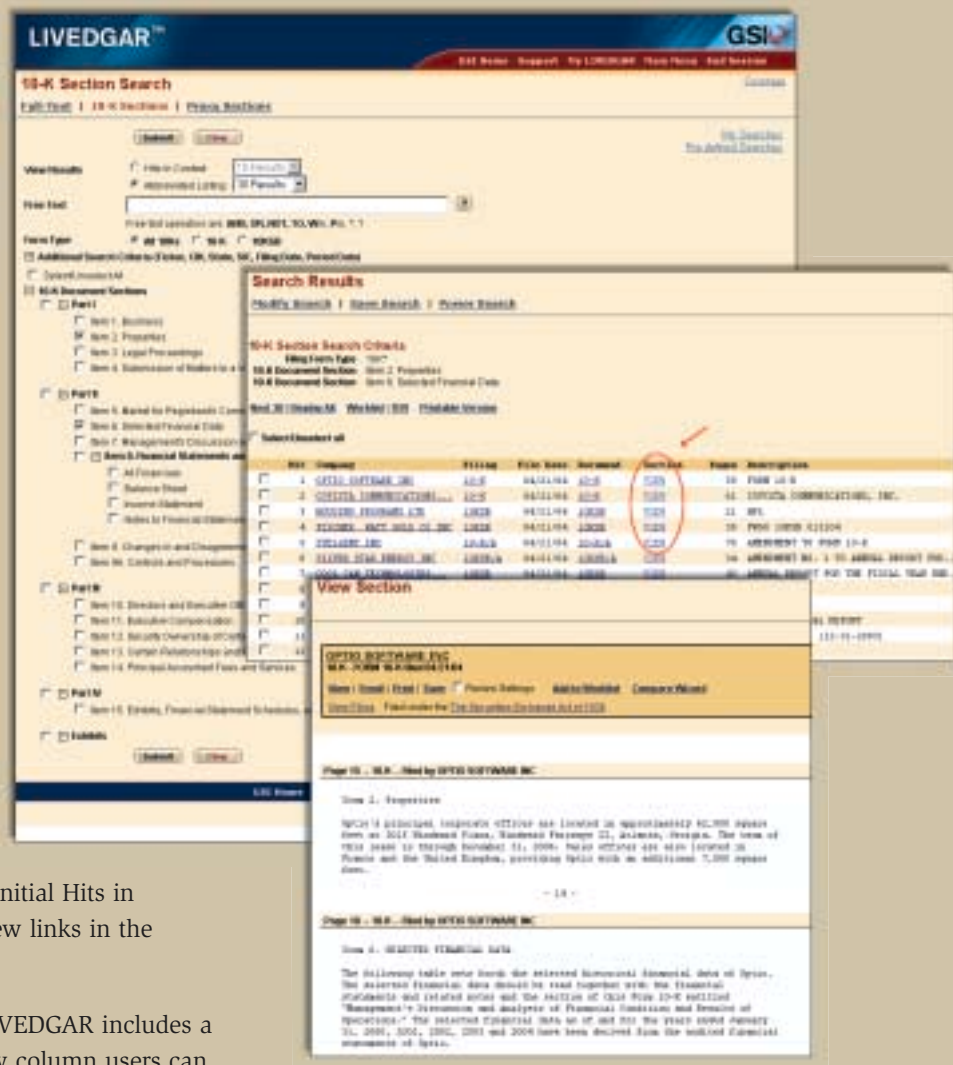
This powerful new functionality simplifies the research process significantly and enables users to view, e-mail, print or save single or multiple document sections in one easy step.

On the Abbreviated Listing Results page, LIVEDGAR includes a new column entitled Section. From this new column users can click on the View link to see results limited to the section or sections chosen on the 10-K and Proxy Section Search input pages. If users prefer to view the document in its entirety, the Filing and Document link is still available as always.